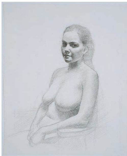
CLOCKWISE FROM ABOVE LEFT